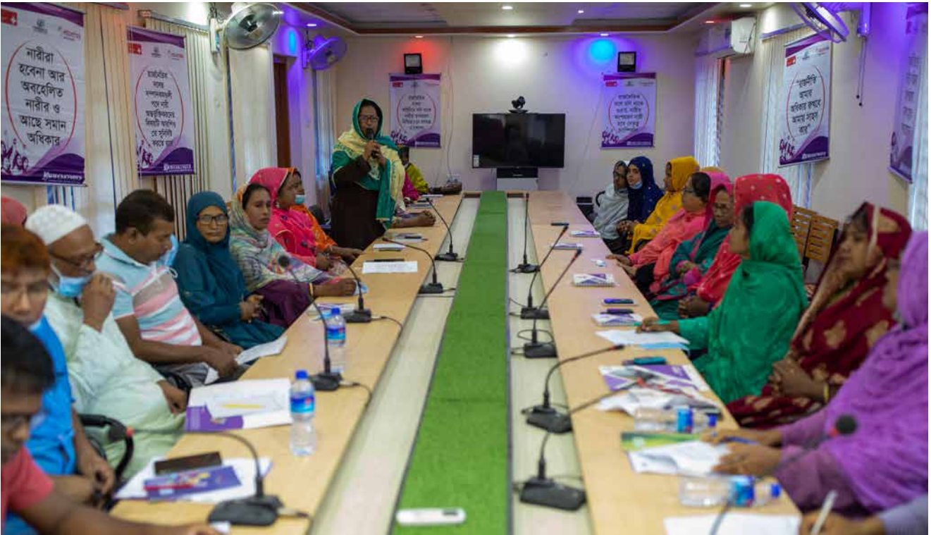
Members from Aparajita forum take a meeting with local political leaders in Birampur Upazila, Dinajpur on 25 July 2022, Bangladesh.

With regards to risks, less experienced or value-aligned local organisations may be overwhelmed with the management of large funds, which bears some danger of voluntary or involuntary mismanagement , eventually backfiring on the whole sector.